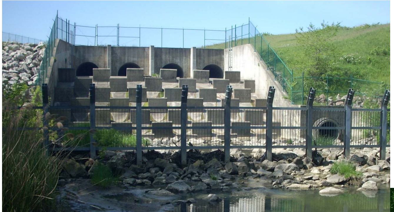
Figure 2. Above photo is the discharge of Abram Creek culvert from the airport expansion.

Figure 3. Right photo is a waterfall on Abram Creek between the culvert opening and the confluence with Rocky River.