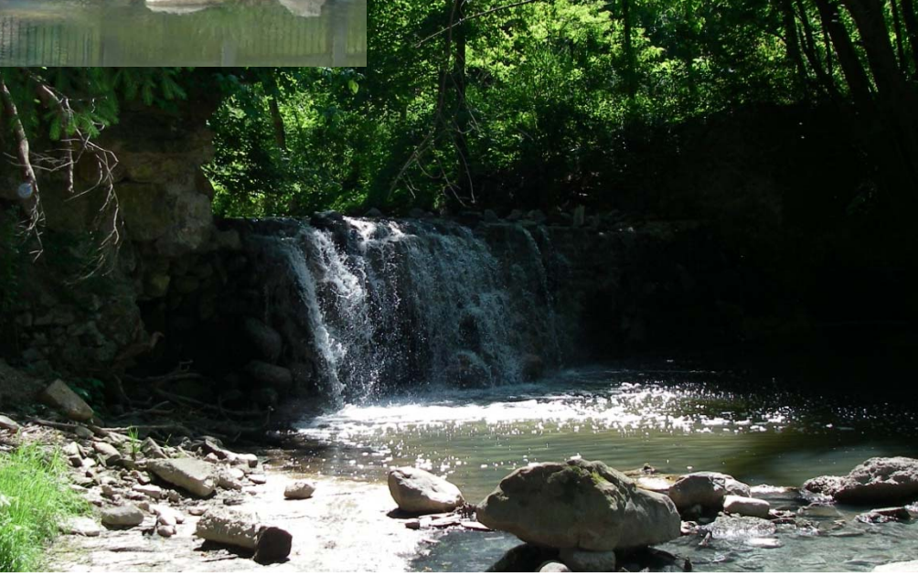
Figure 3. Right photo is a waterfall on Abram Creek between the culvert opening and the confluence with Rocky River.

Figure 2. Above photo is the discharge of Abram Creek culvert from the airport expansion.