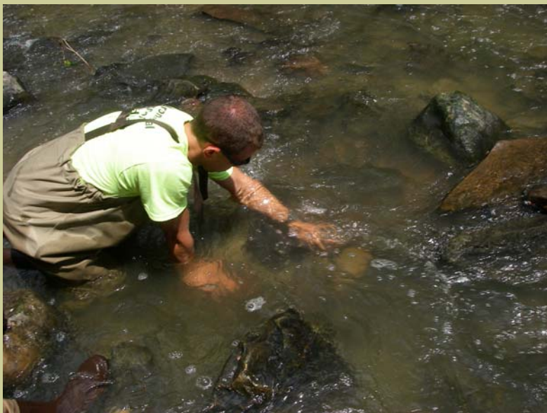
Installing a Hester-Dendy Artificial Substrate Sampler