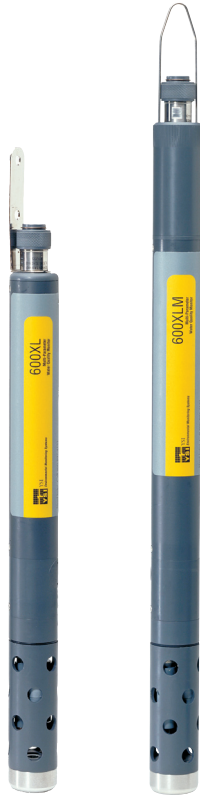
The YSI 600XL and 600XLM