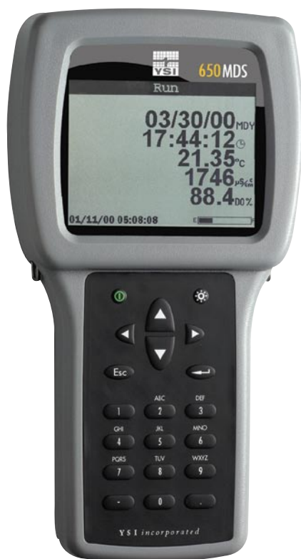
The YSI 650 Multiparameter Display System

Easily log real-time data, calibrate YSI 6-Series sondes, set up sondes for deployment, and upload data to a PC with the feature-packed YSI 650MDS (Multiparameter Display System). Designed for reliable field use, this versatile display and data logger features a waterproof IP-67, impact-resistant case.