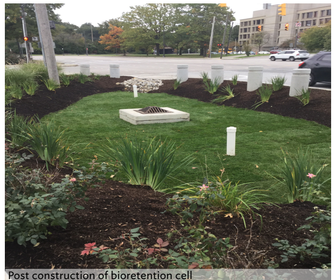
Post construction of bioretention cell