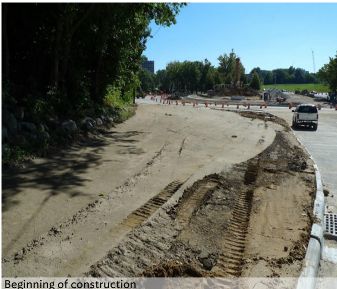
Beginning of construction