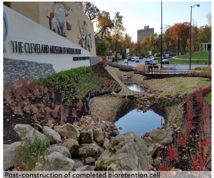
Post-construction of completed bioretention cell