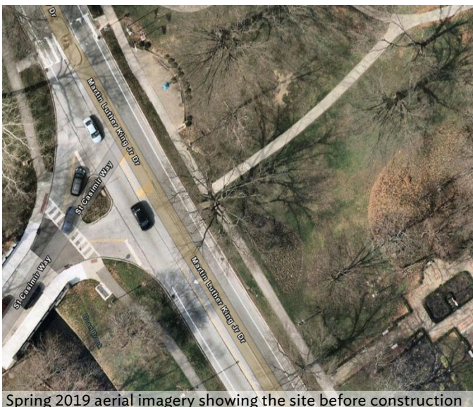
Spring 2019 aerial imagery showing the site before construction