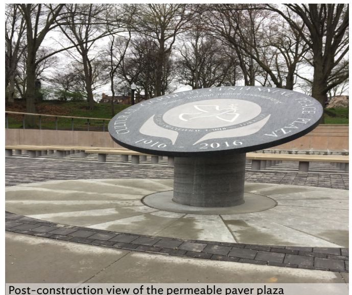
Post-construction view of the permeable paver plaza